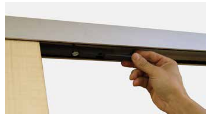
8b: Insert hanger into door.