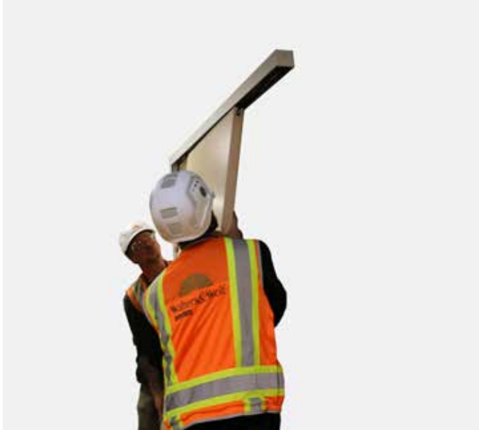
8a: Hang door onto track.

Before Hanging Door: Apply Pemko S771 to the inside face of the back of the door.