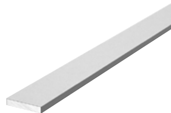
Filler Bar (x1)