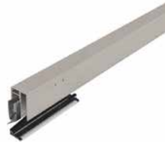
Planet-SN-RD-A Door Bottom