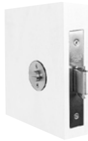
Privacy Lockset (x1)