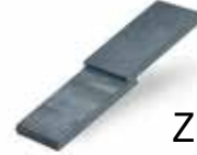
Z Clips (x9)