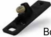
Bottom Guide (x1)